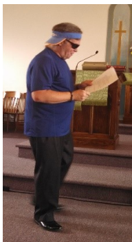
VBS July 26, 2015